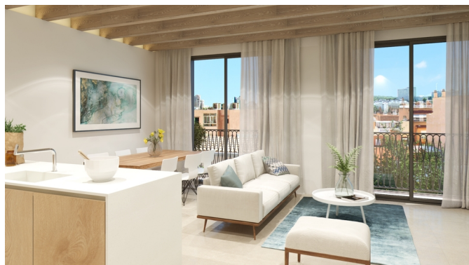
HOUSE A_ground & first floor